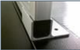
PolarPlex Mounting Bracket

The Standard Containment Panels are mounted to rack tops or to supporting Unistrut with the PolarPlex™ Mounting Brackets. These one eared brackets are simple to install and the panels just slide into the channel where they are held tightly in place.